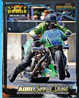
Bike: 2015 Romine 200 ci Nitro Harley Weekend Chassis, B&J 2 speed trans, Mickey Thompson Tires